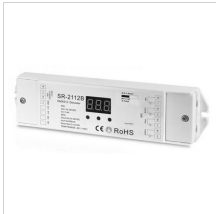
178973 RGBW DMX enabler/decoder 4 channel (0.35A each CH)