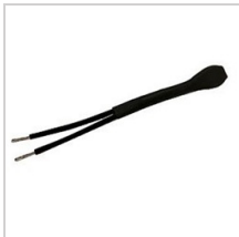
11015 Terminating Resistor