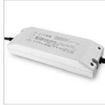
17096 Kit driver 48V WP