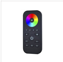
310429 RGBW hand held remote