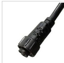
110150 Terminating Resistor WP