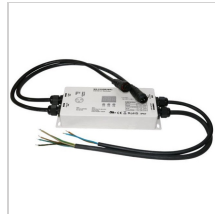
1789730 RGBW DMX enabler/decoder WP 4 channel (0.35A each CH)