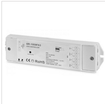
3104173 RGBW RF controller 4 channel (0.35A each CH)